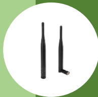
Wi-Fi Rubber Antenna