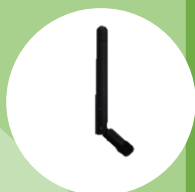
Cellular Rubber Antenna