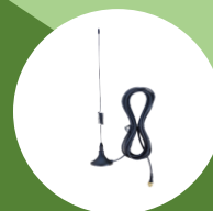
Wi-Fi Magnet Antenna