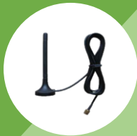
Cellular Magnet Antenna